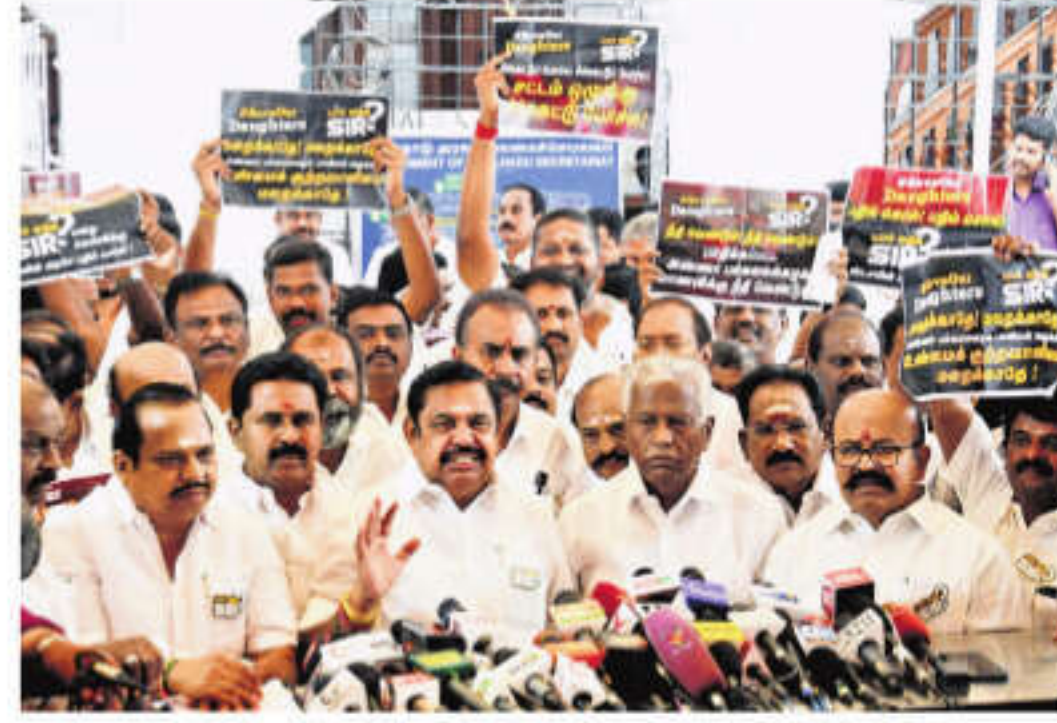
AIADMK MLAs led by General secretary EPS walks out on the first day of Assembly session in Chennai on Monday

Stating that the House holds the national anthem in high regard, Speaker M Appavu and Leader of the House, Duraimurugan, later said that recital of the Tamil invocation song at the beginning of the session and the national anthem after the governor's address has been the convention. Chief Minister M K Stalin