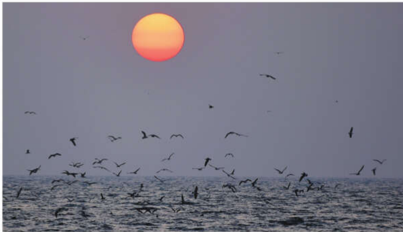
AN ODE TO THE SETTING SUN